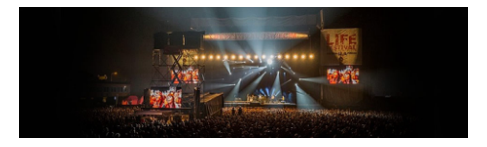
The Life Festival and VIP Benefit Gala for the One Humanity Institute: A City of Hope Oświęcim, Poland | Summer 2018

At this highly exclusive one-day event at the UN, we will convene dignitaries, philanthropists, strategic partners, thought leaders, heads of UN agencies and media to launch the One Humanity Institute: A City of Hope. We will present the evolving concept that embraces the ideas and activities of peace, anti-violence and long-term healing, and also weigh insights and views while continuing to be fully respectful of the historical past of Auschwitz, while moving into the potential of a modern world that focuses on peace and sustainability. At a closed-door meeting, we will engage individuals who will help us design and steward this vision. Individuals who will be invited include Kofi Annan, Bill and Hillary Clinton, Yad Vashem representative, Holocaust Survivors representative, the US Ambassador to Poland and Ted Turner.