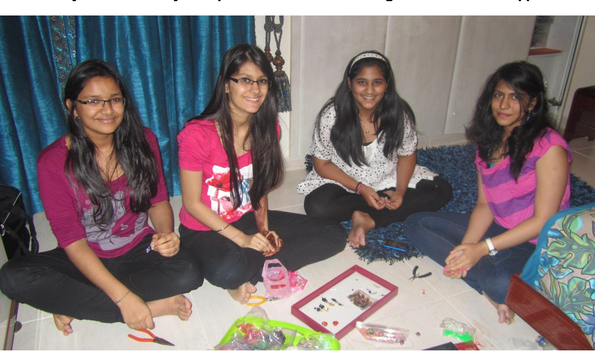
We Youth joined to make jewelry from colorful beads, organize funds and support LEA