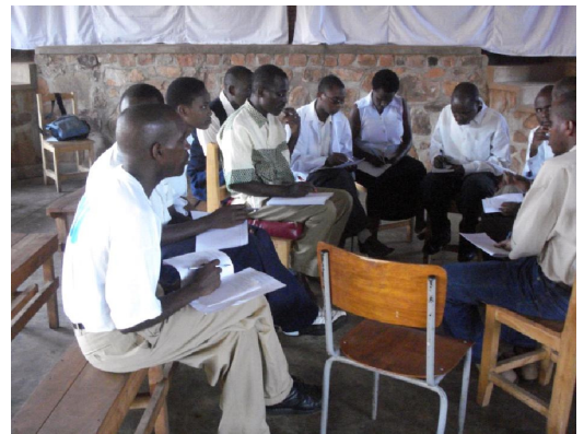
Pictured right: People deep in discussion around how to prevent corruption during the Peace Day event hosted by Shalom in a community just outside the capital, Kigali, in October.